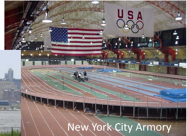
New York City Armory