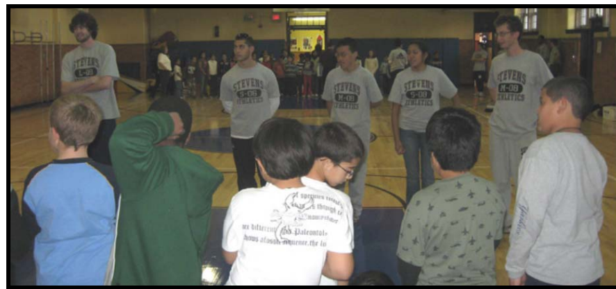
STEVENS DUCKLING PROGRAM