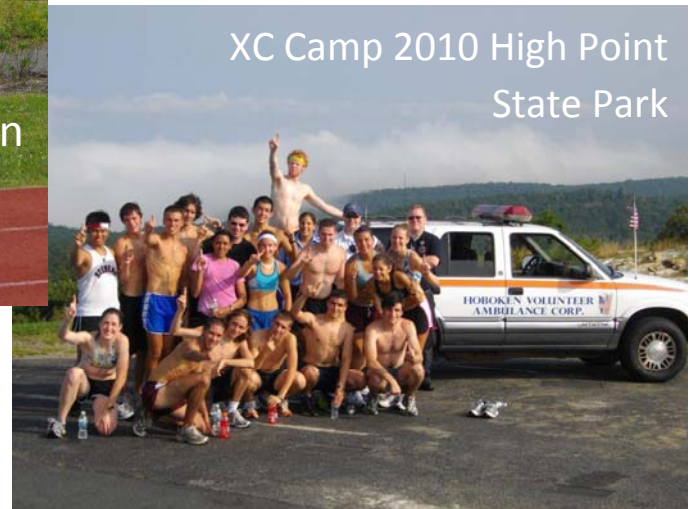
XC Camp 2010 High Point State Park