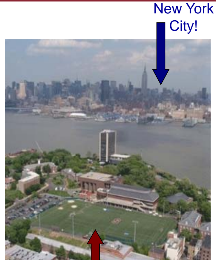
Stevens Institute of Technology Hoboken NJ